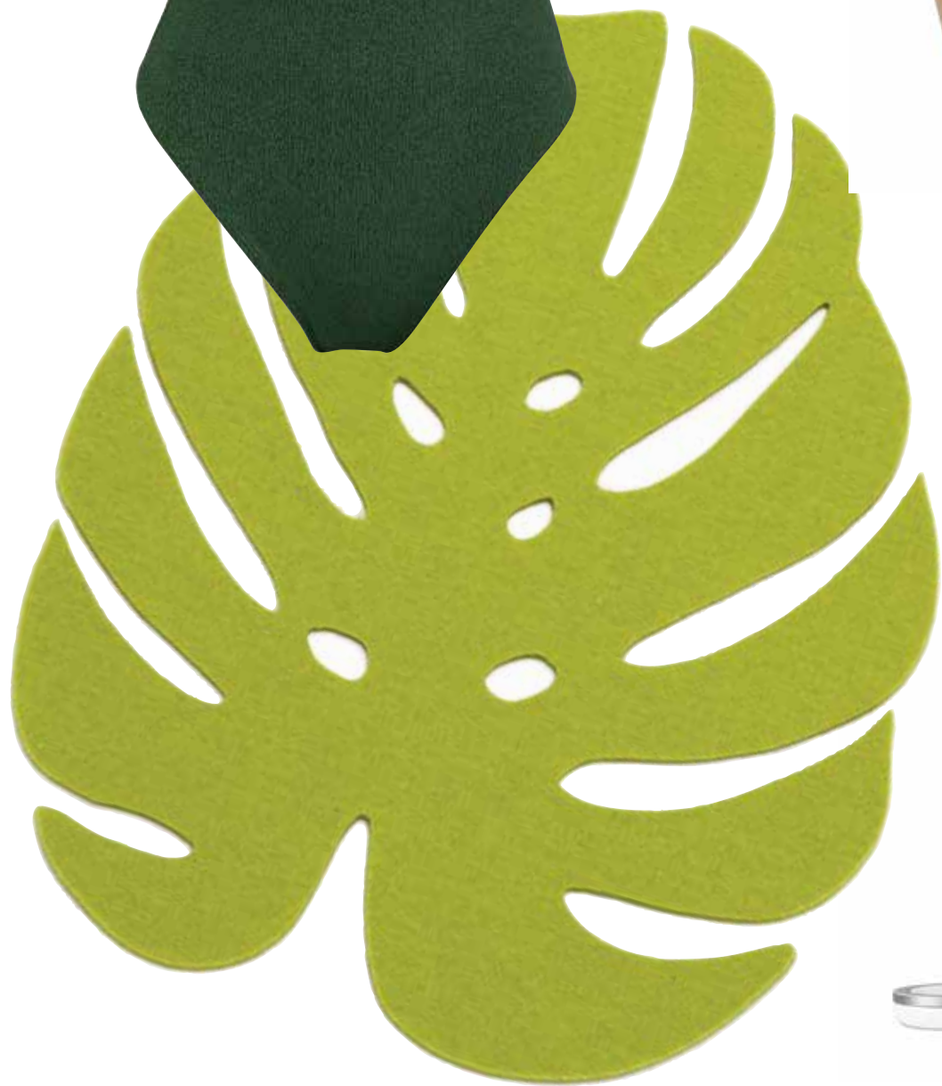
Graf Lantz Monstera leaf trivet, $26, graf-lantz.com