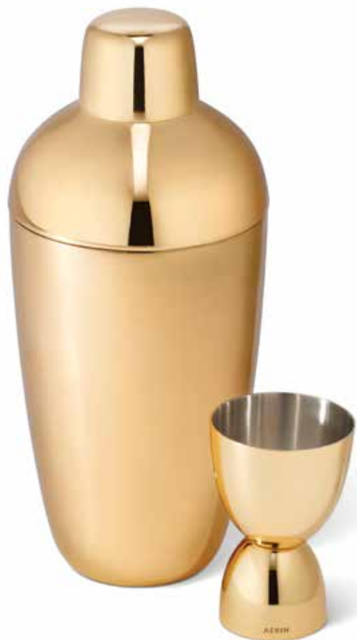
AERIN Fausto jigger and shaker set, $125, Nest Inspired Home, Rye, NY