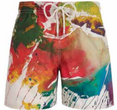
Vilebrequin x John M. Armleder Gra swim trunks, $290, vilebrequin.com