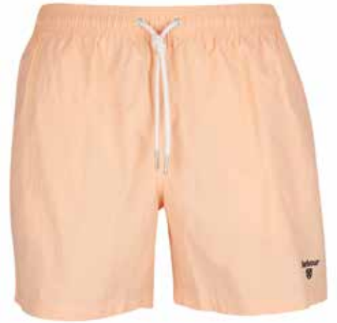
Barbour Essential logo swim shorts, $70, barbour.com/us