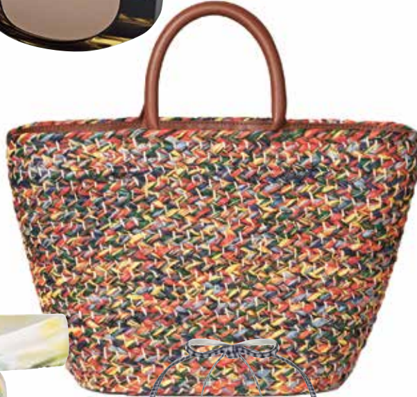
Cesta Rainbow Mélange top handle raffia tote, $650, cestacollective.com