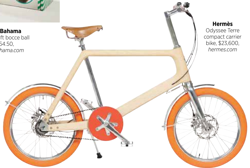
Hermès Odyssee Terre compact carrier bike, $23,600, hermes.com