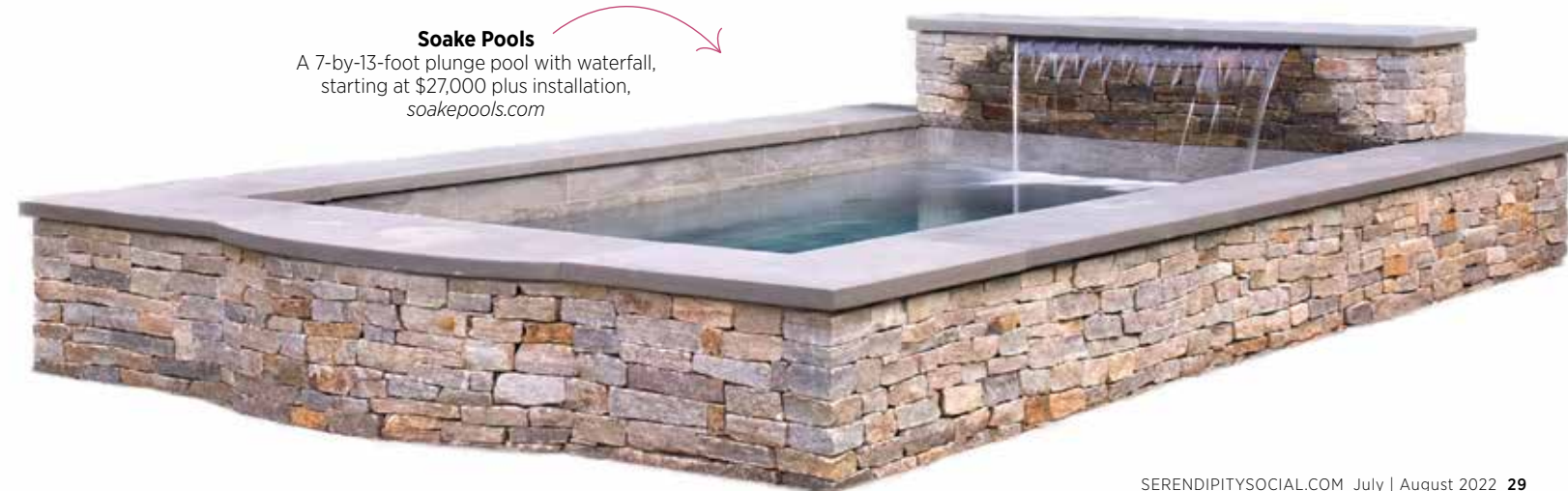
Soake Pools A 7-by-13-foot plunge pool with waterfall, starting at $27,000 plus installation, soakepools.com