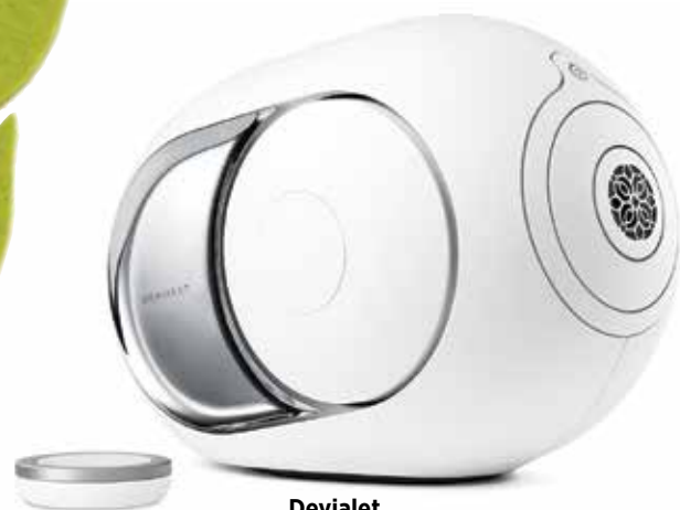
Devialet Phantom I 103 dB wireless speaker, $2,200, Bloomingdales, White Plains, NY