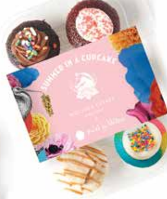
Baked By Melissa x Wölffer Estate Summer in a Cupcake, starting at $34, bakedbymelissa.com