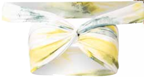
Silvia Tcherassi Gavi bikini top and Peticaria bikini bottom in teal, $140 each, find similar at silviatcherassi.com