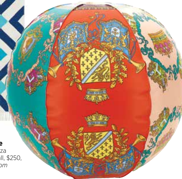
Versace La Vacanza print beach ball, $250, versace.com