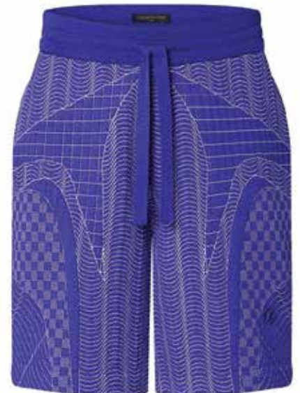
Louis Vuitton Men's Technical shorts, $1,520, louisvuitton.com