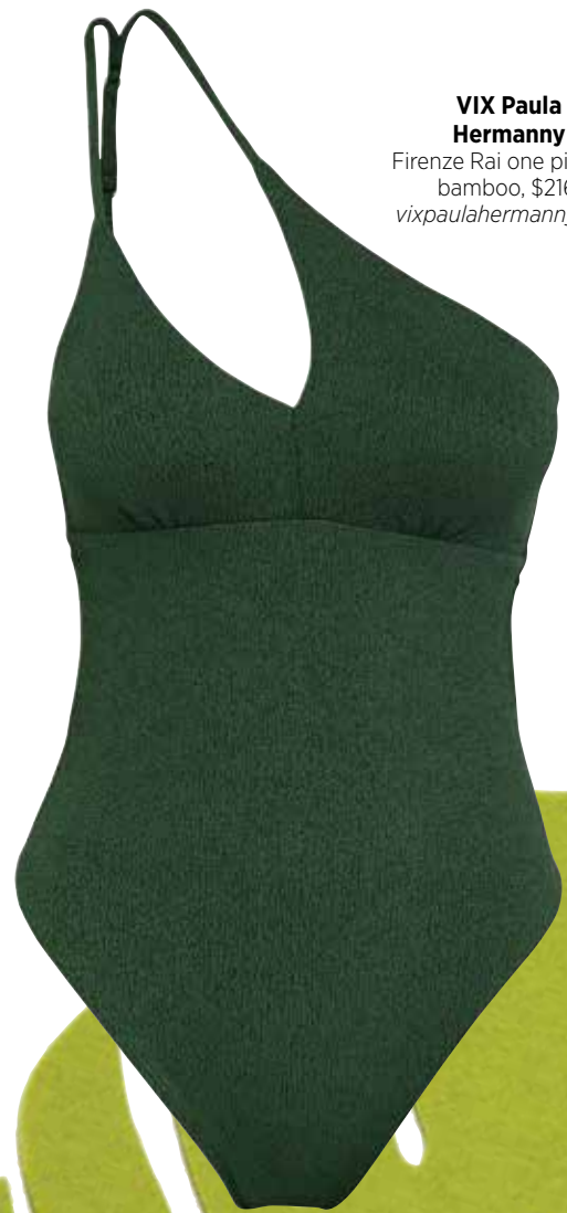
VIX Paula Hermann Firenze Rai one piece in bamboo, $216, vixpaulahermann.com