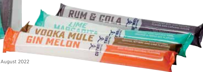
Cutwater Frozen cocktail spirits pops, from $24, drizly.com