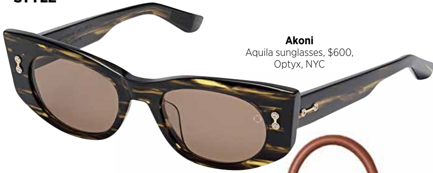
Akoni Aquila sunglasses, $600, Optyx, NYC