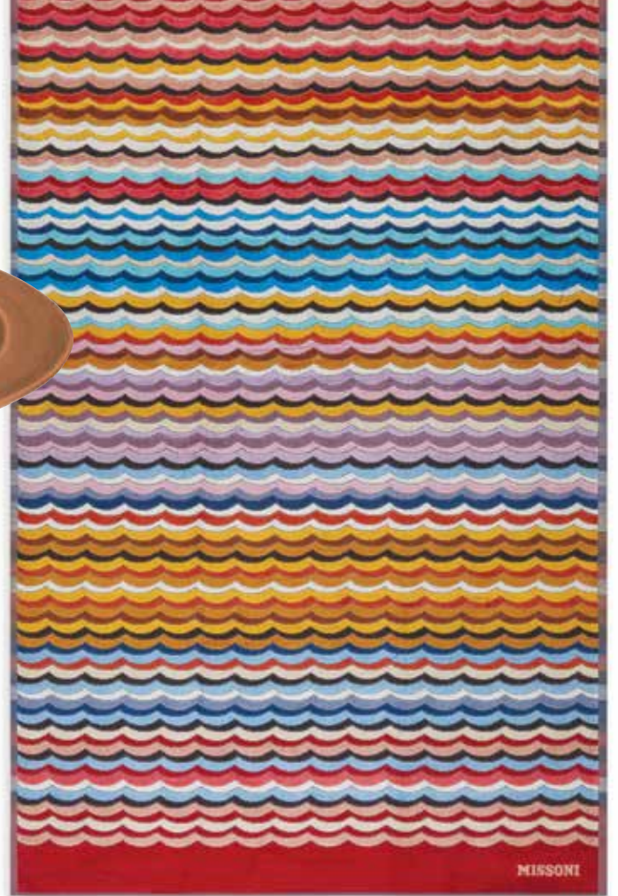
Missoni Home Beverly beach towel, $255, missoni.com