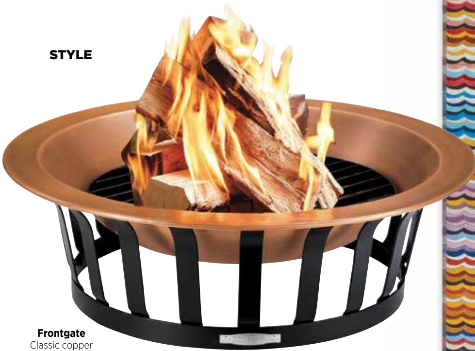
Frontgate Classic copper fire pit, $649, frontgate.com