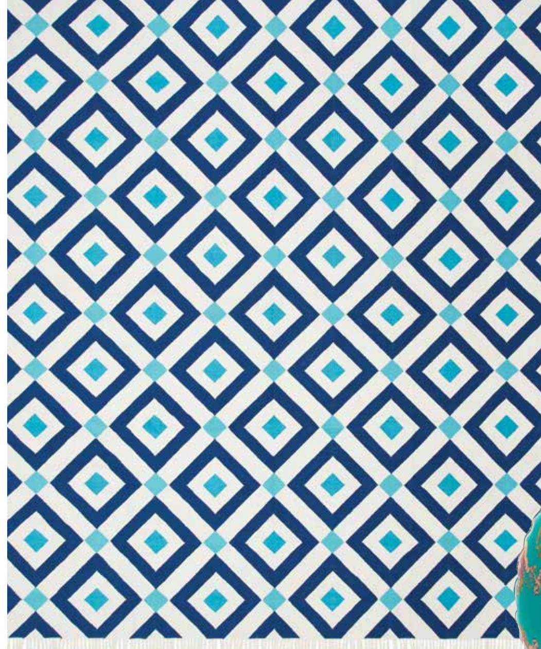
Jonathan Adler Crawford outdoor rug, starting at $995, jonathanadler.com