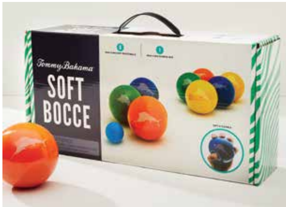
Tommy Bahama Malachite soft bocce ball set, $54.50, tommybahama.com